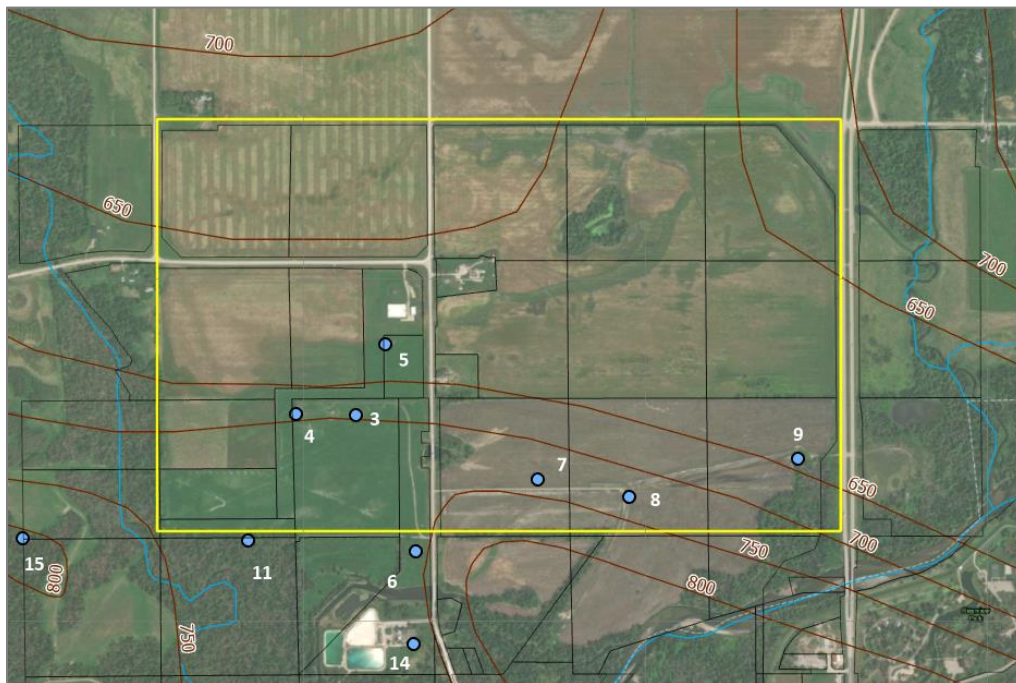
Figure 1. Site map outlining the general area of interest and the estimated bedrock elevation contours.

Greg Brennan, PG, PHG Research Hydrogeologist