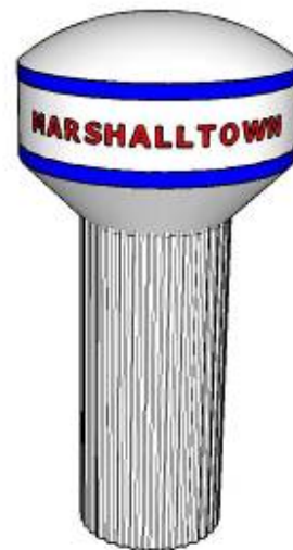
NEW WATER TOWER WHEN COMPLETED

Construction of the new 0.5 million gallon water tower has begun. The new water tower will improve the reliability for our customers in the higher elevation zone. Progress on the tower will be seen throughout the next year. Scheduled completion will be spring 2010.